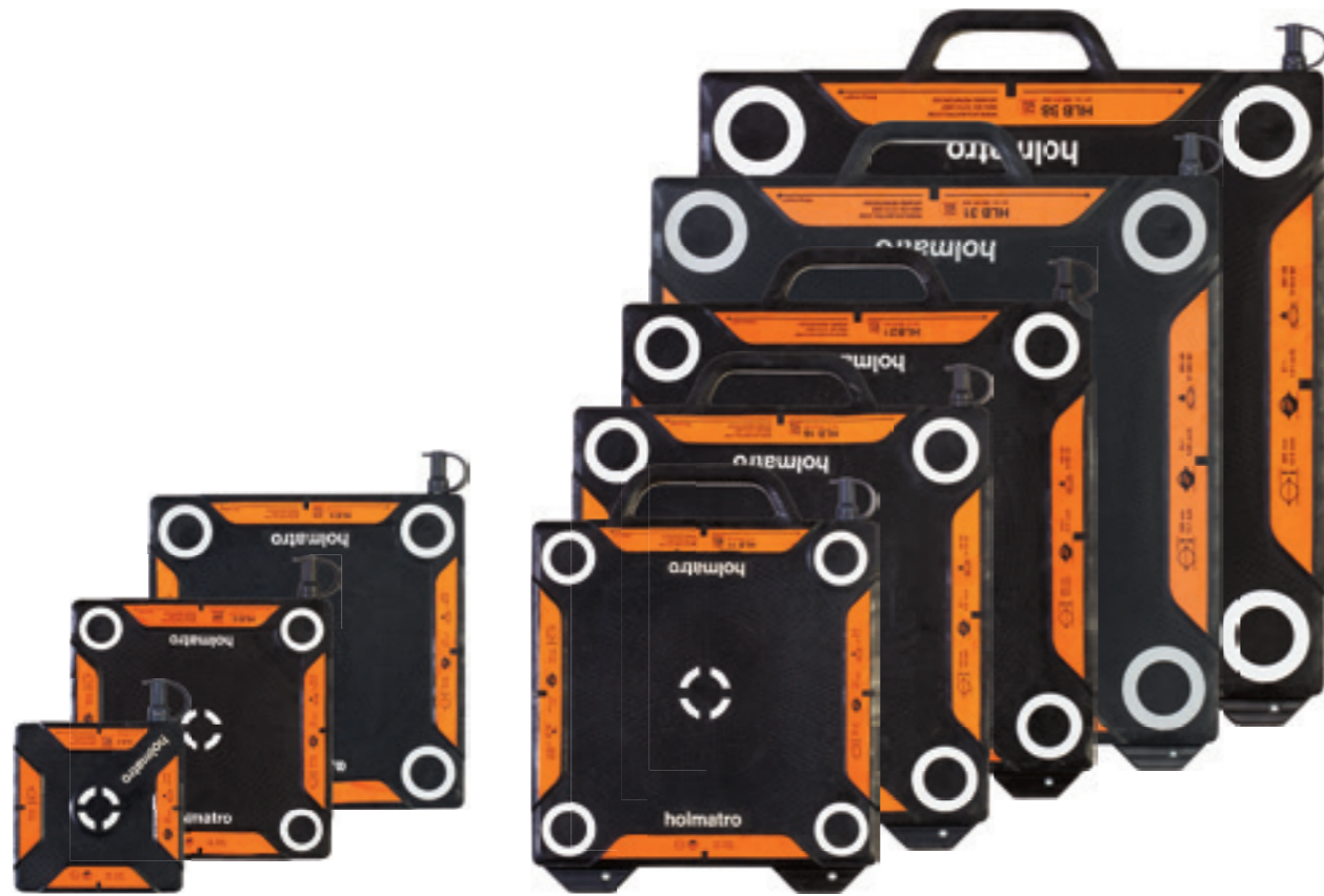
SMALL HLB 2 HLB 6 HLB 8

Choose your lifting bag: with a 50% increase in power you can get the same job done using a smaller and lighter model.