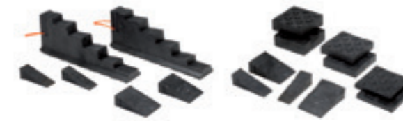
Chocks & Blocks