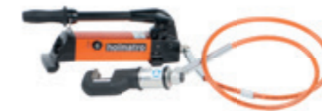
HMC 8 U & PA04 H2