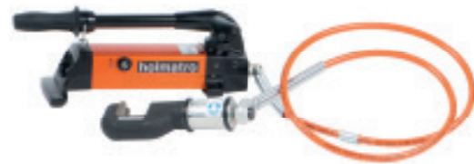
HMC 8 U & PA 04 H2