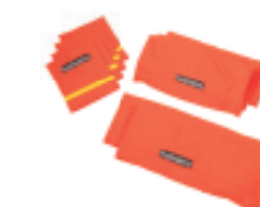
SEP 10 Set