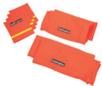
SEP 10 Set